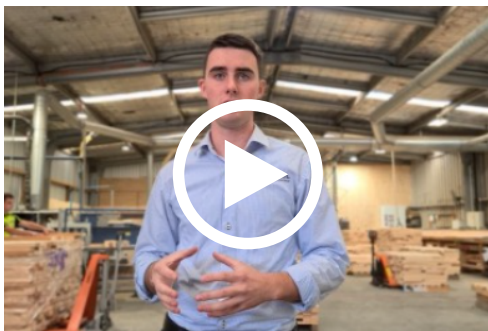
What Voids My Warranty

Did you know our technical team have been hard at work last year turning our FAQs into videos? Click HERE to check them out on our YouTube channel.