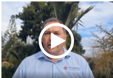
Why No PL17?